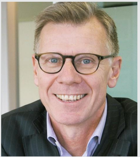
Mr Nicholas Pole

Te Tumu Whakarae mō Te Tari o te Pirimia me te Komiti Matua Secretary of the Department of the Prime Minister and Cabinet Te Tari o te Pirimia me te Komiti Matua | Department of the Prime Minister and Cabinet Commenced April 2024